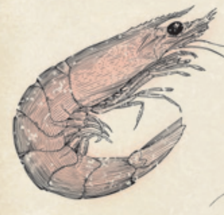
Fig 1. Prawn

SPICY CHICKEN BITES Tender chicken bites with your choice of BBQ sauce or spicy Firecracker sauce