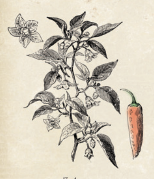
Fig 4. Red Chilli Plant

NACHOS Choose from tortilla chips or our fajita spiced 'nachos grande' topped with Cheddar and your choice of: