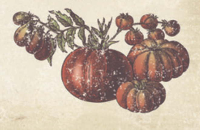
Fig 11. Tomatoes