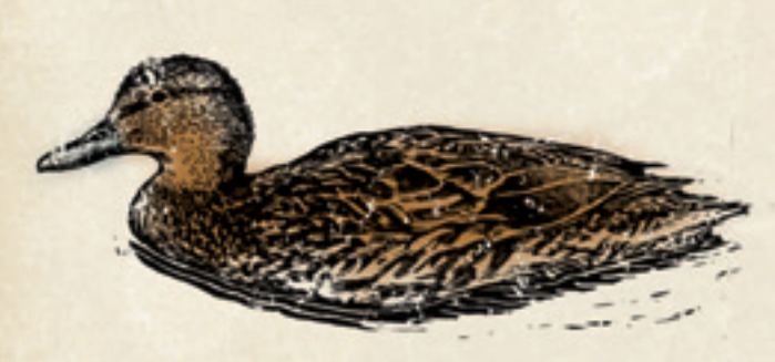
Fig 10. Duck

Upgrade your chips to thick cut gourmet chips for 50p