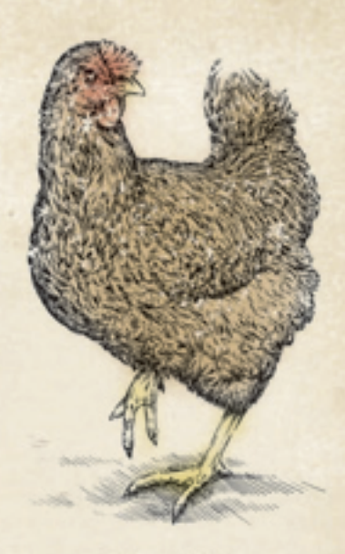
Fig 5. Chicken

Upgrade your chips to thick cut gourmet chips for 50p